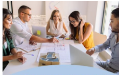
Working with a chronic condition Tips to help you stay employed

The benefits of employment reach far beyond just financial, however navigating work with a chronic condition can bring its own challenges.