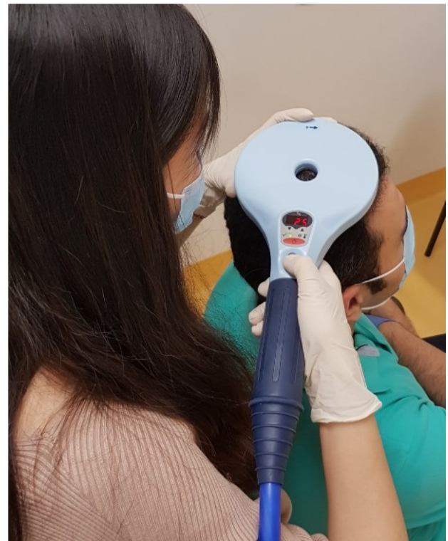
Magnetic brain stimulation being delivered to a trial participant.